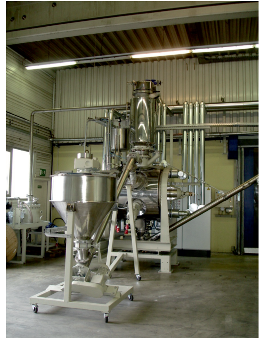
Process and large scale plant for stabilisation